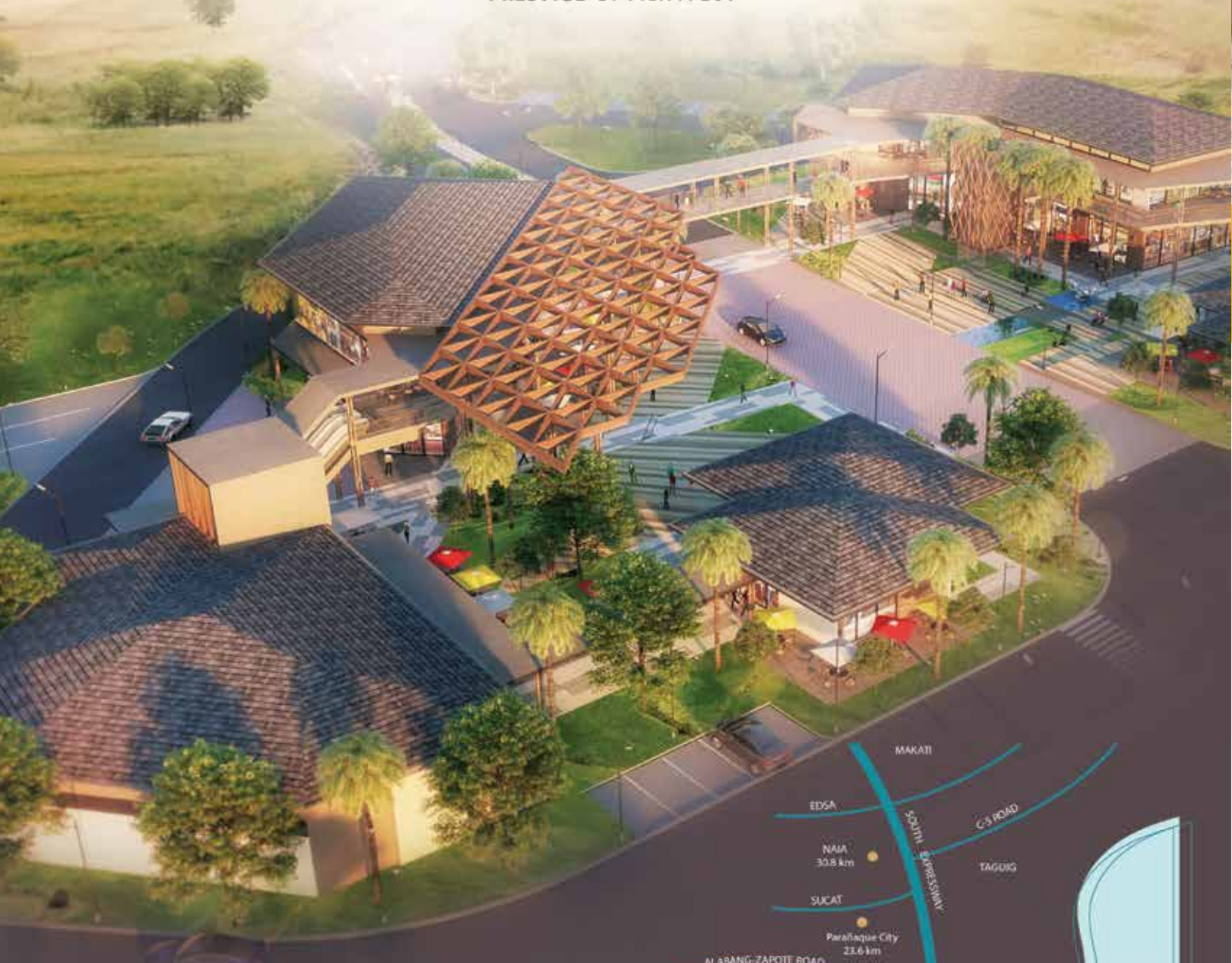
Artist's perspective of the Village Front

Live in a master planned community with the luxury of open space and a full suite of amenities surrounding your home for the redefined living experience.