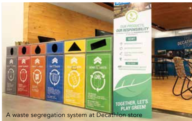
A waste segregation system at Decathlon store

Decathlon, as a socially and environmentally responsible company, believes in giving back to the community and in fulfilling one’s duty as a steward of the environment. As one of its sustainability and eco-efforts, Decathlon hosts regular eco-runs, wherein teams pick up trash along their running routes. Not only do they get to rev up their heart rate for the day’s cardio, but they’re able to exercise their duty of protecting the environment.