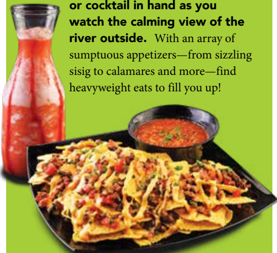
Pink Slush and Nacho Nasty

After a hard day's work, sit back and relax with a beer or cocktail in hand as you watch the calming view of the river outside. With an array of sumptuous appetizers—from sizzling sisig to calamares and more—find heavyweight eats to fill you up!