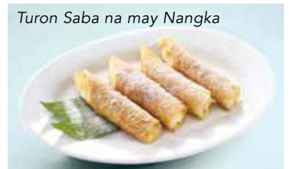
Turon Saba na may Nangka